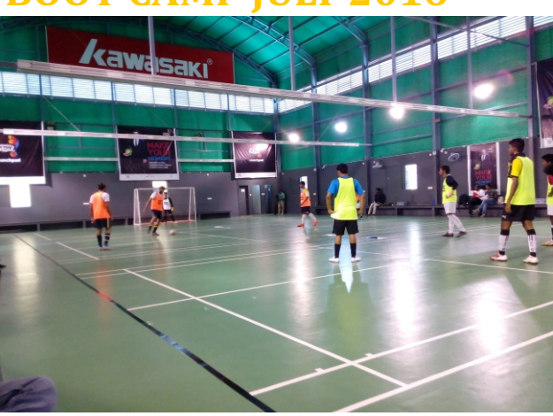
Visit Wikipedia, fb- Premier Futsal for more details