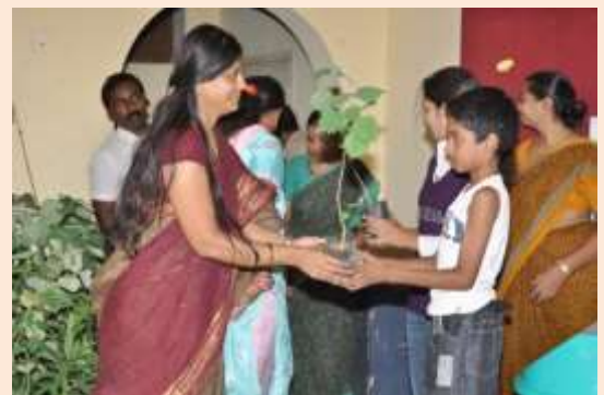
Students exchange e-waste for saplings