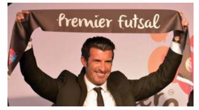
Premier Futsal aims to promote and increase the awareness of futsal through investing in talent hunts, community building and infrastructure development, all culminating into the 3-week tournament celebrating the best talent in the world.

Premier Futsal is set to launch it's inter national editions in 2019.